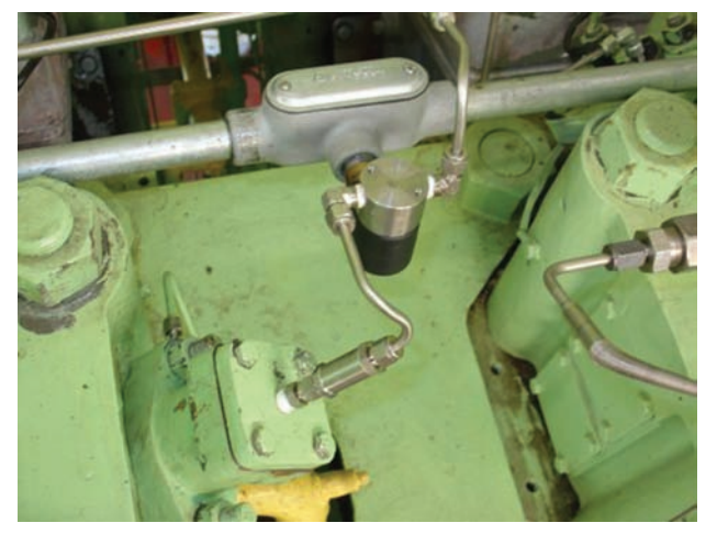
Pneumatic air distributor with pilot-actuated air-in-head valve

Installation of the SaveAir system on engines with an existing pneumatic air distributor (OEM or aftermarket) and pilot actuated in-head starting valve represents the least complex installation requirements to the user.